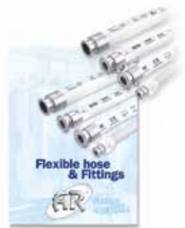
FLEXIBLE HOSES & FITTINGS