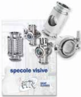
SIGHT GLASS-FLOW INDICATOR