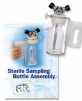
ASEPTIC SAMPLING BOTTLE