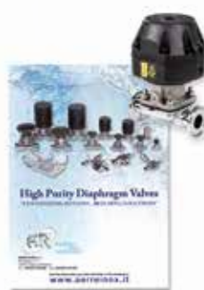
HIGH PURITY DIAPHRAGM VALVES