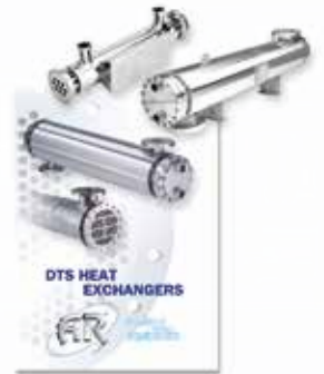
DTS HEAT EXCHANGERS