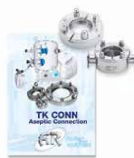
TANK AND IN-LINE CONNECTIONS