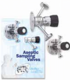
ASEPTIC SAMPLING VALVES