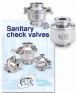
SPRING CHECK VALVES