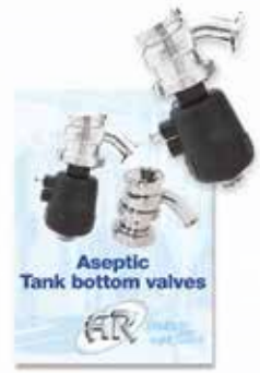
ASEPTIC TANK BOTTOM VALVES