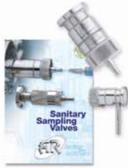
SANITARY SAMPLING VALVES