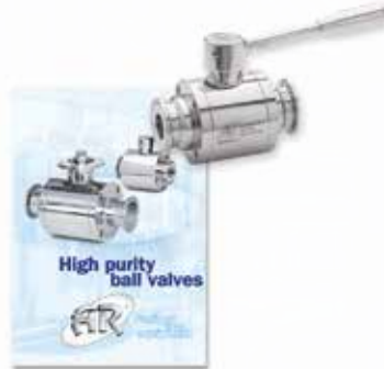
HIGH PURITY BALL VALVES