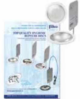
HYGIENIC RUPTURE DISC